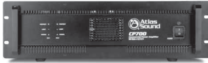
CP700 (Front View)