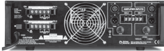
CP700 (Rear View)