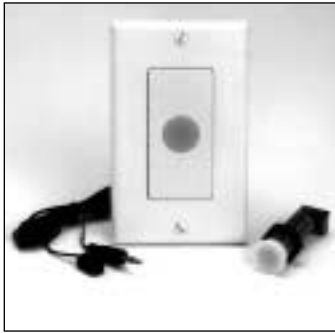
F-1 M-1AJW* M-1A

*(Shown with decora style cover plate. Order separately.)